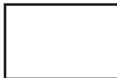
Half Pages 4.5" X 7.5"

ALL ADS SHOULD BE IN PDF OR JPEG FORMAT. NO BLEED